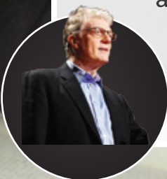
Sir Ken Robinson Creative Schools

Big Picture schools foster the kind of learning that can only happen when education is allowed to extend beyond the walls of the school.