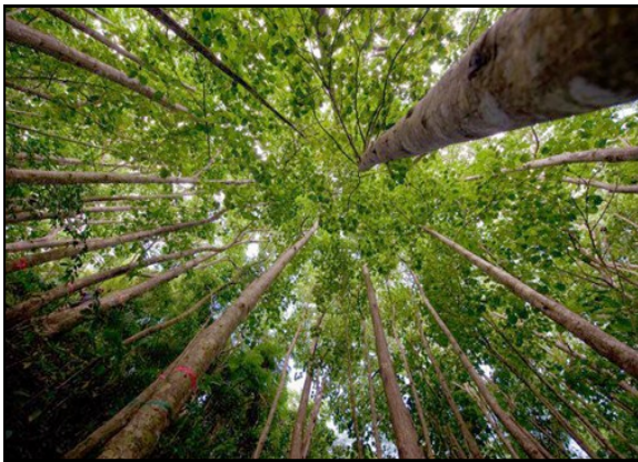
Tropic Ventures creates value-added projects and sells timber of the fast-growing and exotic Blue Mahoe tree ( Hibiscus elatus Swartz), which can grow to 80 feet.

Founded in 1983 and owned jointly by the Global Ecotechnics Corporation and Decisions Team, Inc., Tropic Ventures is an organization that runs the Las Casas de la Selva Rain Forest Enrichment Project (Las Casas). The project encompasses 1,000 acres of forest in southeastern Puerto Rico, roughly 300 of which are actively managed. The objectives of the project are to develop and demonstrate ecological approaches to timber production. Further, dissemination of the research findings and promoting sustainable timber practices in Puerto Rico are important measures of success for the project. The community has been minimally involved in Las Casas to this point, but there are significant volunteer, research, and environmental education opportunities for community engagement. The small Las Casas staff is open to engaging the surrounding communities and have just begun to create links to residents and schools to foster better understanding of the economic alternatives and viability of rainforest communities.