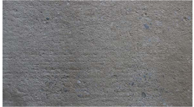
▲ A bare concrete floor where only screeding was done.

floating, you could choose to “brush” the floor which can be done to improve traction instead of troweling. “ Polishing ” is another finishing option but may not be a good choice for a wash and pack area due to the slippery nature of this surface finish.