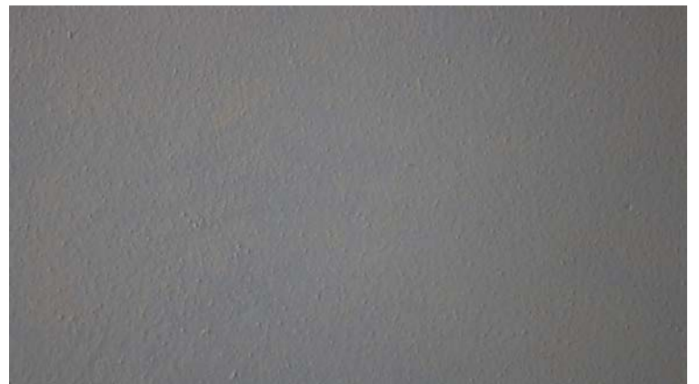
▲ Close-up view of a concrete floor with an epoxy finish

There are many options for coating and sealing concrete including different types of paint, epoxy or rubberized coatings 5 . Many of these can be found at your local building supply or hardware store and can be installed yourself. Floor preparation is important to achieve a durable seal. This includes cleaning (washing), etching (or sanding), and finally application of the sealant by either spraying or rolling. There are contractors out there that specialize in this as well if you want to outsource this task.