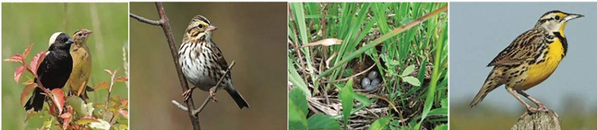
From left to right: boblink, savannah sparrow, nest, eastern meadowlark

land that is at least 20 acres (Eastern Meadowlark prefers at least 40) and regular shaped, making it possible to nest away from woodland and shrubby perimeters where predators may be. They also prefer fields with a 3:1 grass to legume/forb ratio, meaning fields that are legume or other broadleaved species dominated will be less attractive to these birds for nesting. However, they will occasionally choose a spot that does not quite fit that criteria, so it is wise to monitor your fields for bird activity before cutting or grazing them for the first time in the Spring. The birds will pick nesting spots towards the end of May and will be established in the fields for the month of June. Below are different management strategies for protecting grassland birds in your fields: (continued on next page)