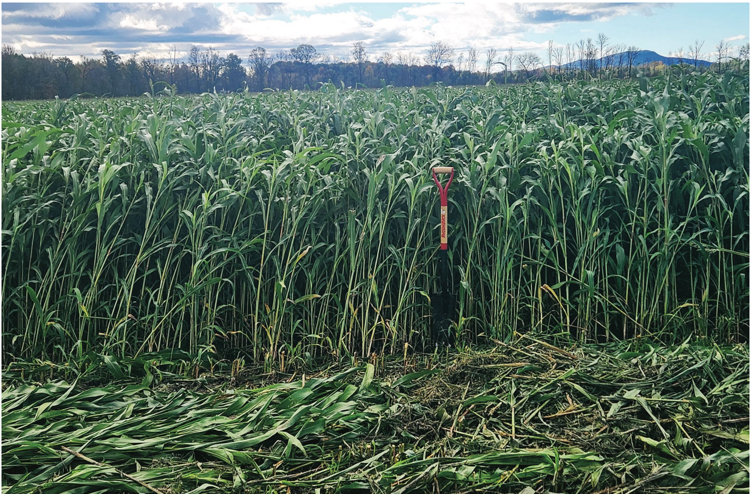
A sorghum-sudangrass crop near Ferrisburgh, Vermont at second cut in late summer 2025.

Corteva intends to replace BMR varieties with higher yielding varieties that have been bred for improved digestibility, however the most digestible conventional varieties currently contain 47%–67% neutral detergent fiber