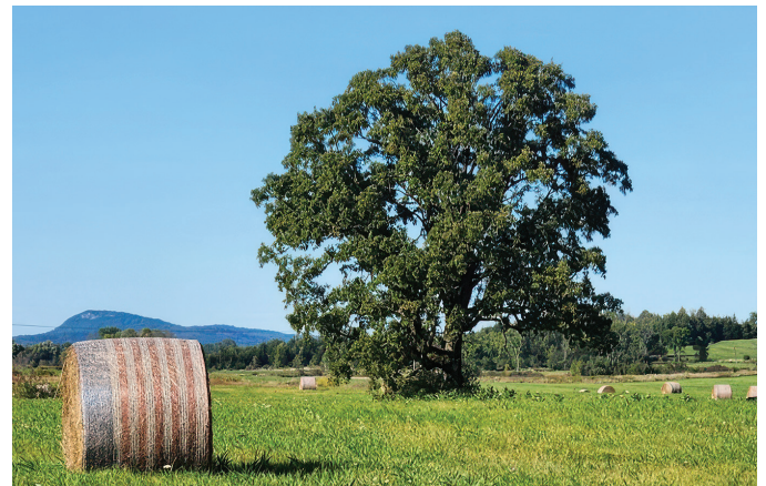
Bales of hay observed during soil sampling at Cutting Hill Beef Farm in Cornwall, Vt.

For crop, soil, and agronomy questions contact me at Shawn.Lucas@uvm.edu .