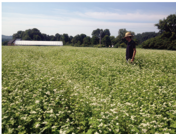
Flowering buckwheat.