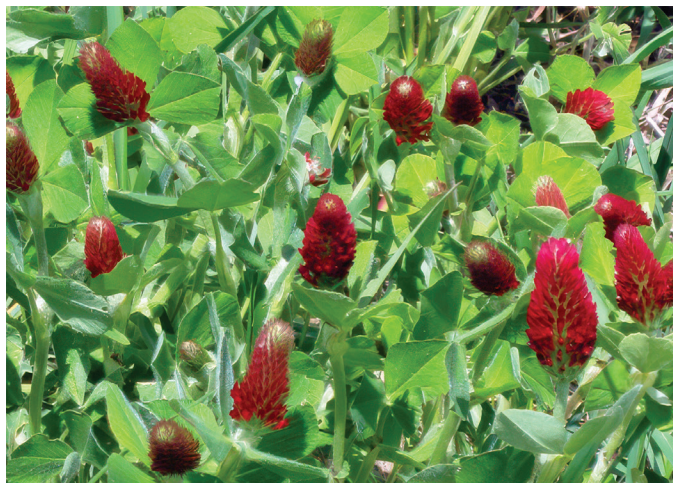
Crimson clover in bloom.