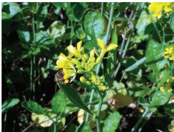
Mustard cover crop with visiting bee.