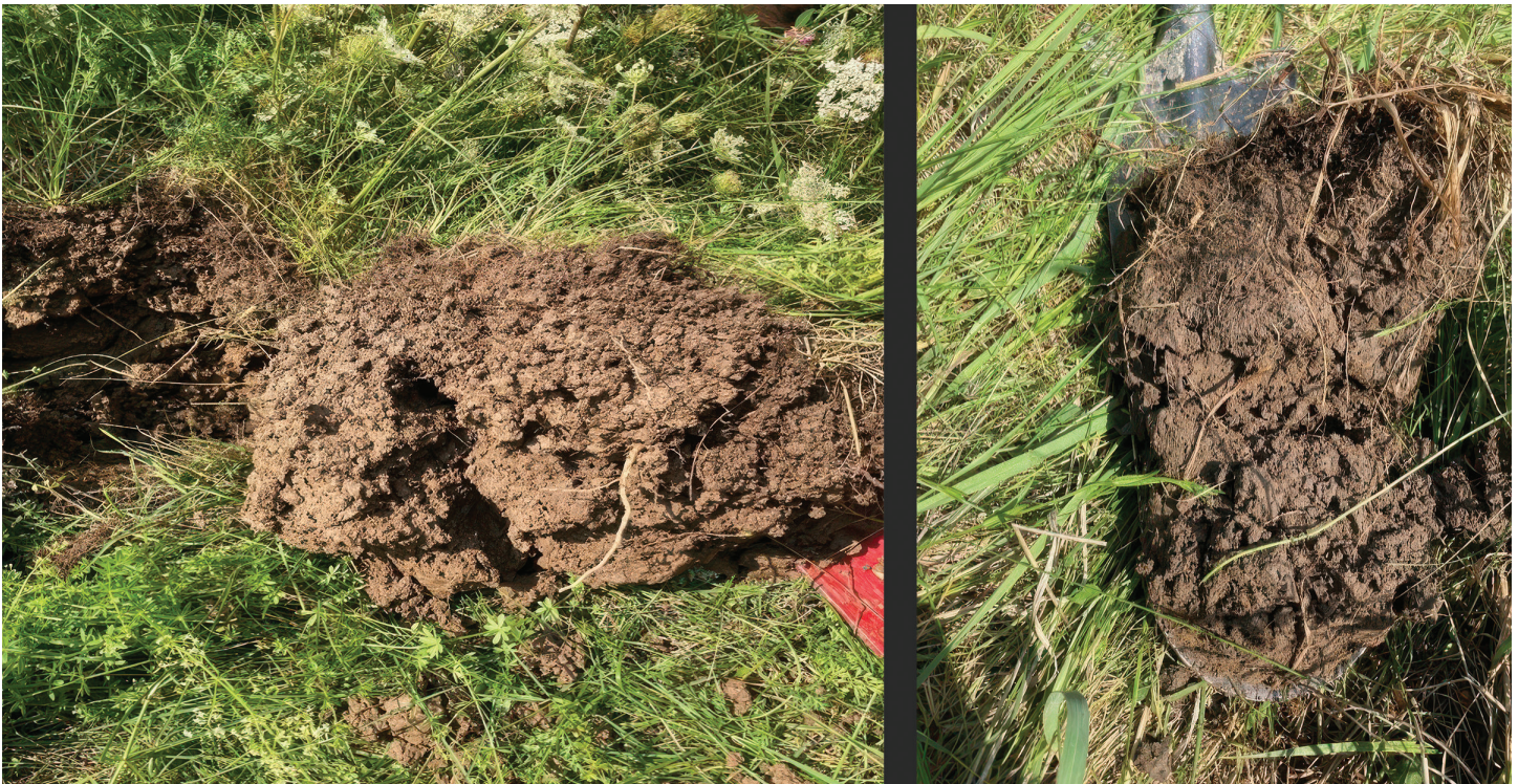
Figure 1: Clay soil from two different shovel tests in Addison County. In photo a (left) we see crumbly soil structure with a diversity of aggregate sizes and deeper roots. The soil profile in b (right) is dense, lacking pore space and aggregation especially in the top three inches, and has a thicker layer of shallow roots at the soil surface.

Where are roots clustered? Does root growth appear to stop at a certain depth? Are roots growing vertically or horizontally? Are there any J-roots that turn and grow horizontally if they hit a compacted area? Shallow roots that are concentrated in the top two inches of