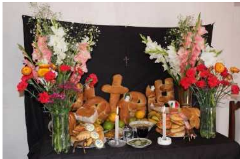
Todos Santos "table," Tiwanaku, Bolivia

of the American Anthropological Association and co-authored "Reflections on Interdisciplinarity in the Study of Childhood in the Past" in the journal Childhood in the Past .