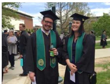
Graduates outside of Bailey-Howe Library on Commencement Day May 2017