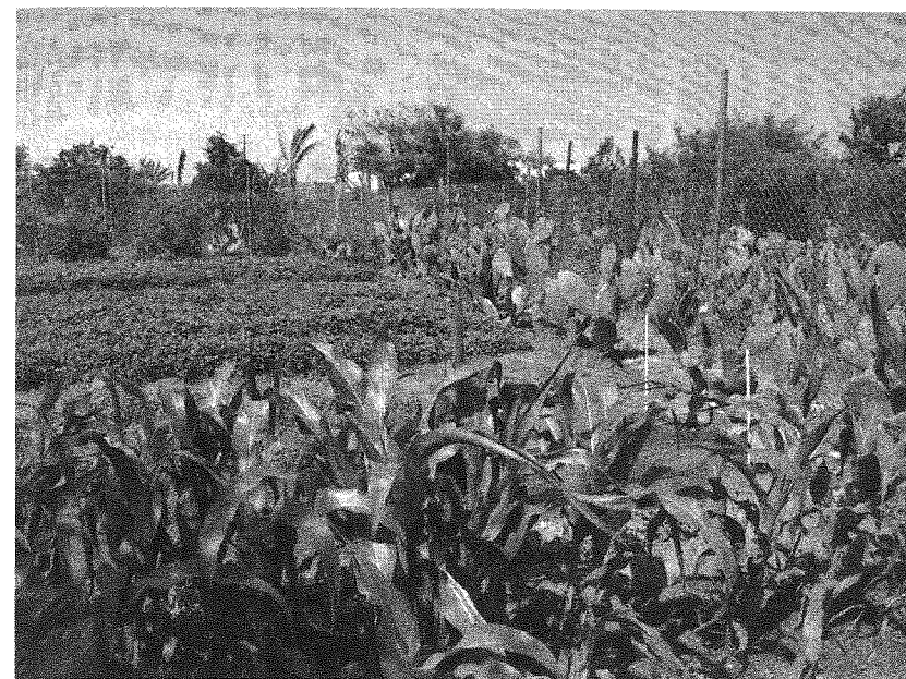
Figure 9.3 Garden plot at South Central showing plants and features similar to the classic Maya garden in figure 9.2

Some 360 families from the urban farm were finally evicted in June 2006. This was the second time that many of the South Central Farmers experienced this sort of violent displacement from the land. However, and this is the point of the “resilience” of Mesoamerican diaspora communities, instead of “disappearing” after eviction, the families maintained a weekly vigil and monthly tianguis (farmers market) on a site across from the old garden. More still, the SCF has developed into a new