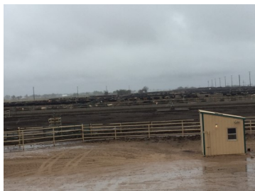
The Kuner feedyard, toured by several project team members.