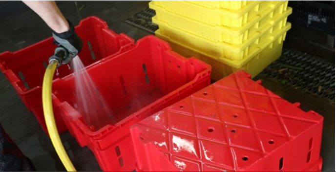
Plastic Harvest Lugs (16"x24"x8")