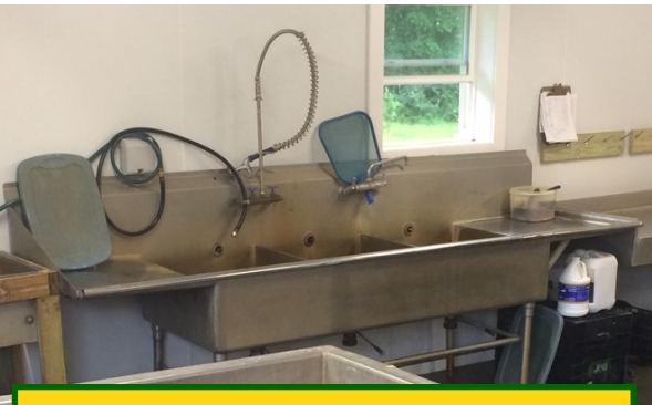
Triple Bay Sink (26"x84")