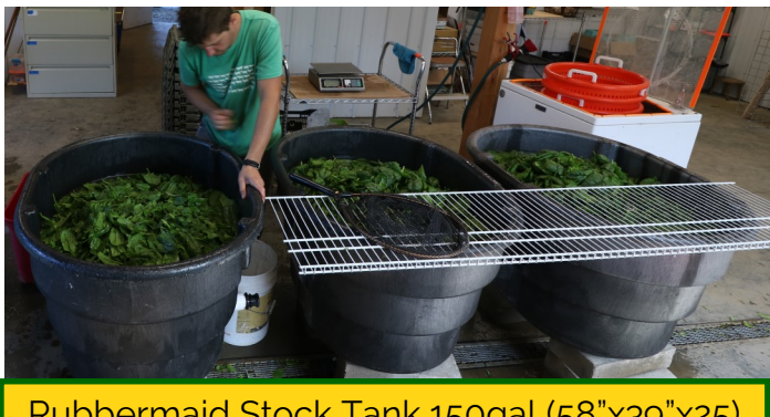
Rubbermaid Stock Tank 150gal (58"x39"x25)