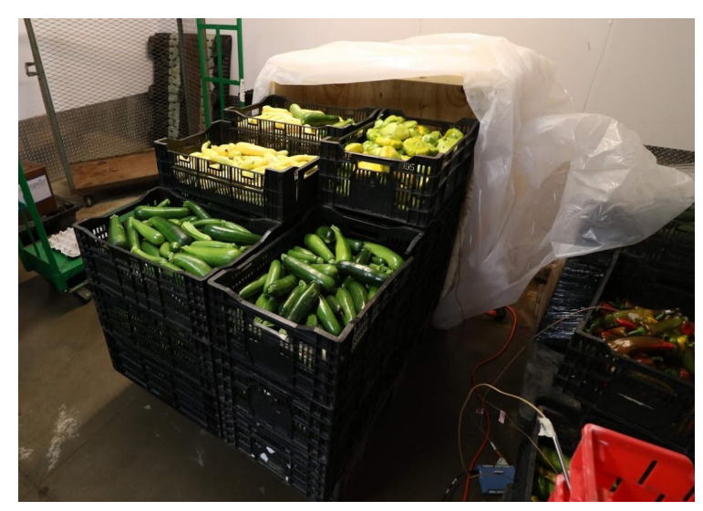
Figure - Comparison of zucchini cooled using room cooling and forced air cooling methods.

Funding for this publication was made possible, in part, by the USDA NE SARE program under grant #LNE16 -347. Thanks to Jericho Settlers Farm for participation in this trial.