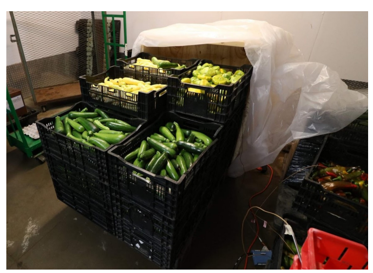
Figure - Comparison of zucchini cooled using room cooling and forced air cooling methods.

Funding for this publication was made possible, in part, by the USDA NE SARE program under grant #LNE16 -347. Thanks to Jericho Settlers Farm for participation in this trial.