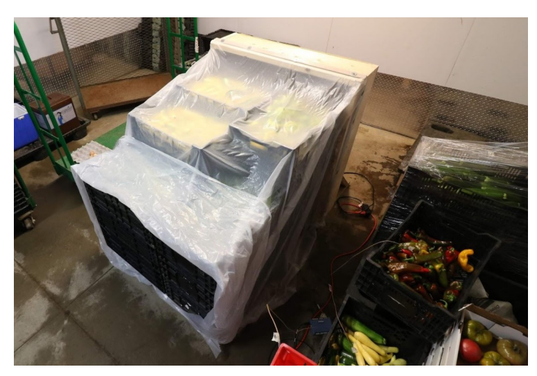
Figure - Comparison of roasting peppers cooled using room cooling and forced air cooling methods.

Funding for this publication was made possible, in part, by the USDA NE SARE program under grant #LNE16-347. Thanks to Jericho Settlers Farm for